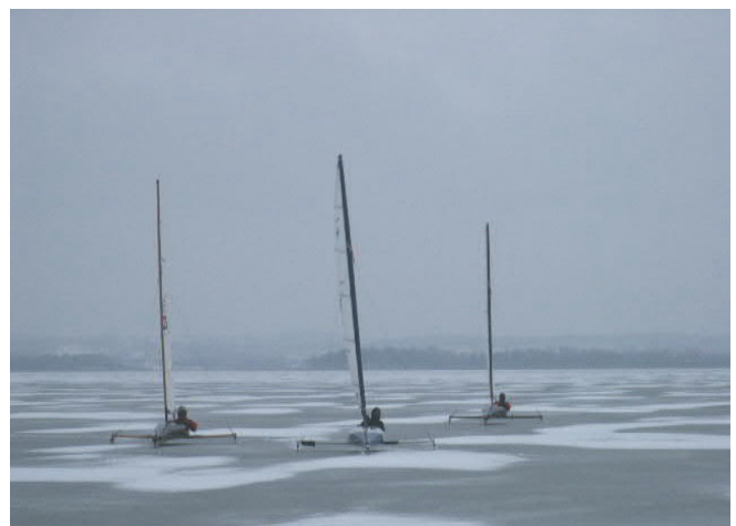
2004 Nite Nationals Lake Christina