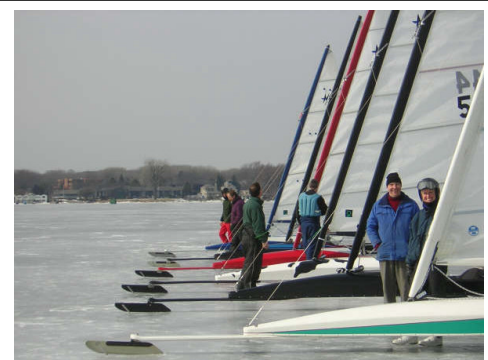
2005 Nite National Mendota