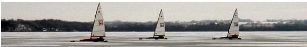
2004 Nite Nationals Lake Christina