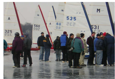
2005 Nite Nationals Mendota

Craig also brought up a change to the rules to allow an adjustable forestay via the use of a typical staymaster fitting. It was explained that this was to make mast rake adjustment easier, faster, and safer without substantially altering the performance of the boat itself. After some discussion this measure was approved by the fleet. More on this as well as other questions will appear in future Nite News publications.